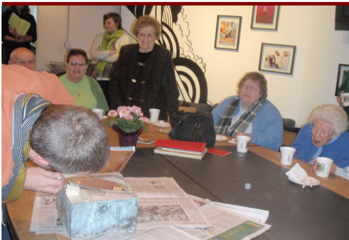
Peeking into the 1938 Time Capsule!