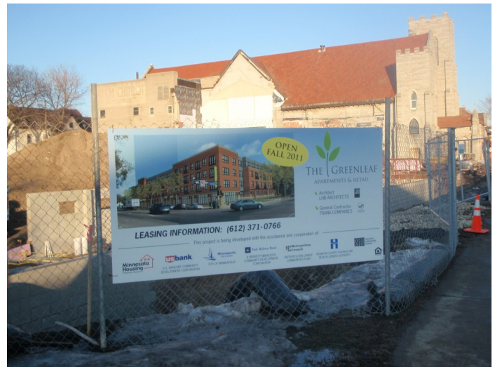
Standing at 28th and Lyndale facing east, northeast with The Greenleaf construction sign in the foreground, and the Ministry Center beyond.